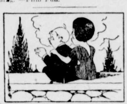
IN HER NAME NOW

"I can't dear; I'm in half mourning." "Well, only stay for half the evening."-Film Fun.