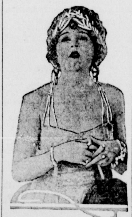
MAE MURRAY Miss Murray has started production in Hollywood on her newest picture "Fashion Row."

SAN ANTONIO—Twelve graduates of the Citizens Military Training Camp, which recently closed here, were recommended for commissions in the United States army. They will be passed upon by an army board before they receive commissions as second lieutenants.