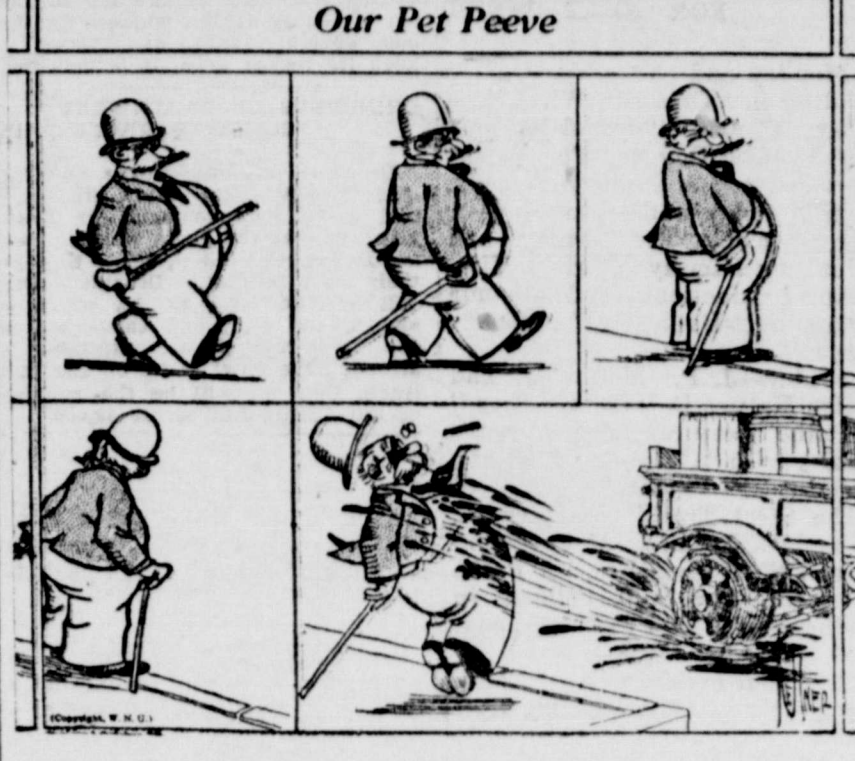
Our Pet Peeve