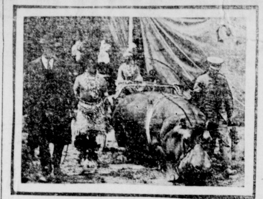
Lotus, the Ten Ton Hippopotamus with Barnes Circus