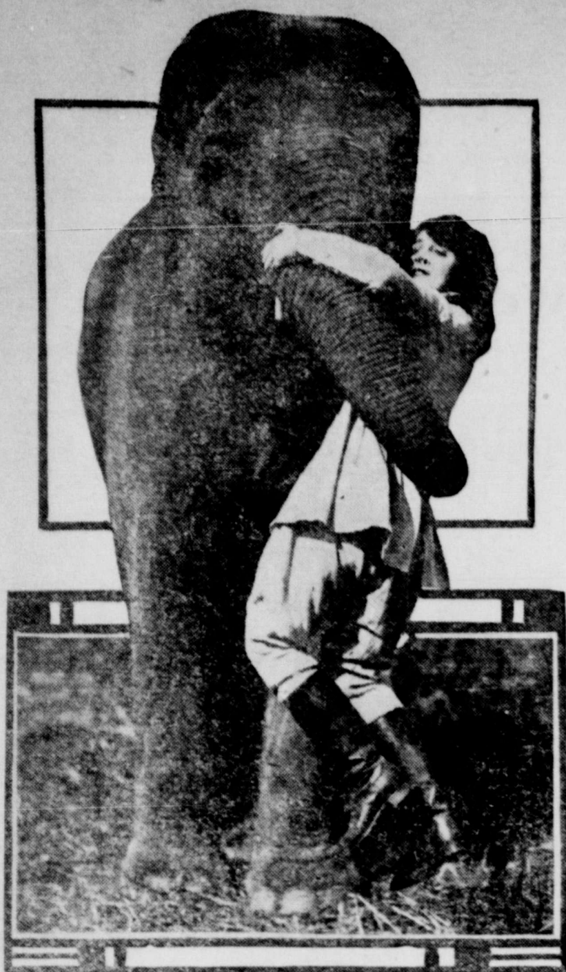
Nice—if One is Used to it!