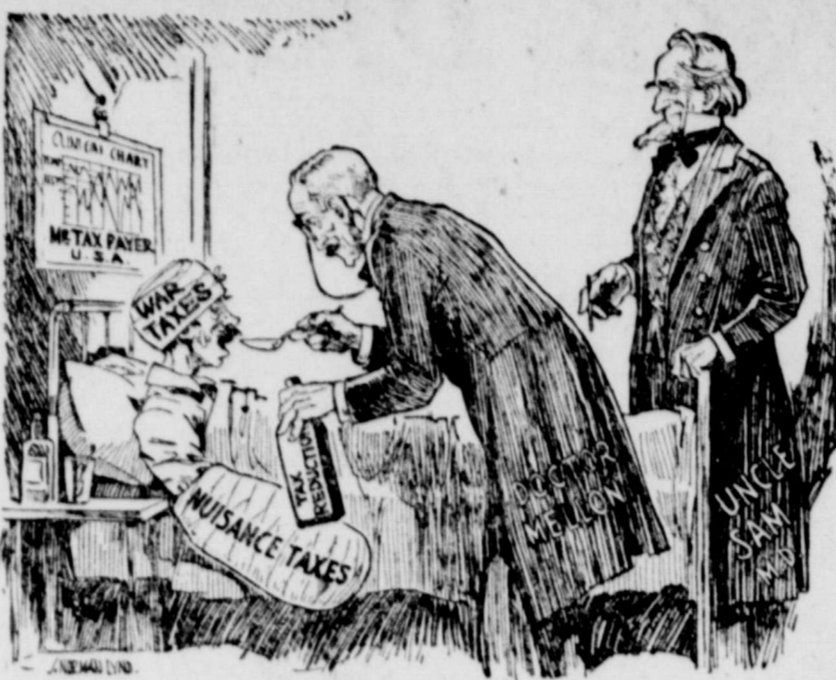
THE NEW DOCTOR'S FIRST CALL It makes the patient sit up and hope he is going to get well.