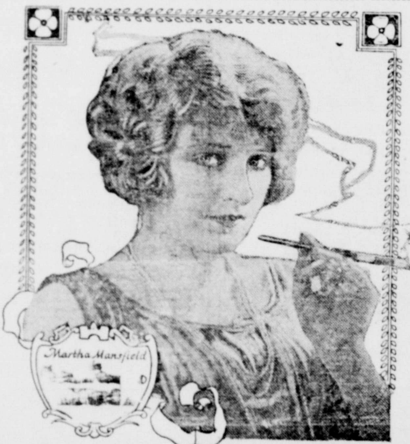
Feminine Star in "Potash and Perlmutter," on screen at Maeroy Theatre next Monday and Tuesday.