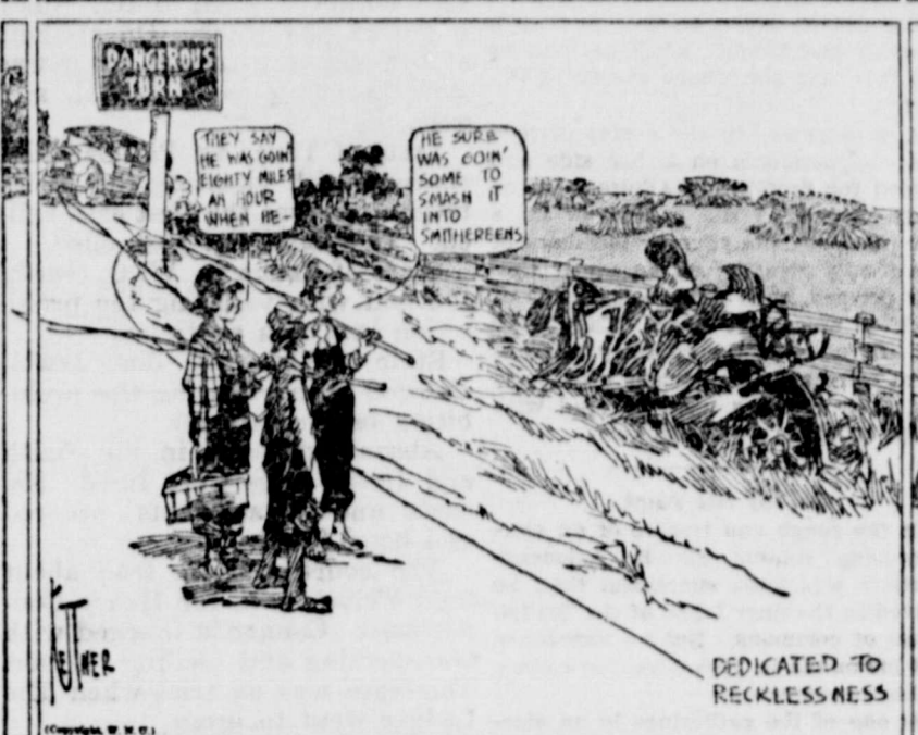
DEDICATED TO RECKLESSNESS