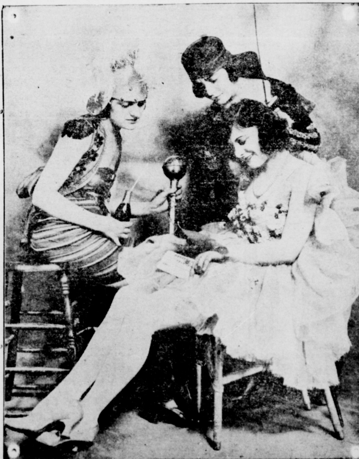
Three of the Premier Dancers in "Cinderella in Jungland" with Golden Bros. Wild Animal Show which will be in Ballinger, Saturday, April 12th, one day only.

2 Performances Rain or Shine 2 and 8 p. m.