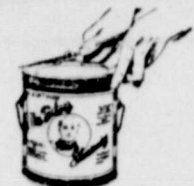
Slip an ice-pick or other sharp-pointed instrument through the hole in the tab of the sealing ring, pointing toward the center of the lid.