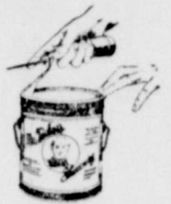
Twist the point outside the rim of the pail and pull up, breaking the seal. Then strip the ring completely off.