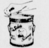
You can lift the lid out with your fingers. But it fits snugly enough to keep the shortening fresh, and keep out all dirt.

IF YOU have ever used Mrs. Tucker's Shortening, you already know how delicious it makes food taste. If you haven't used it, there's a great treat in store for you. A double treat, in fact. For Mrs. Tucker's Shortening is now packed in a New Pail that it is a joy to use.