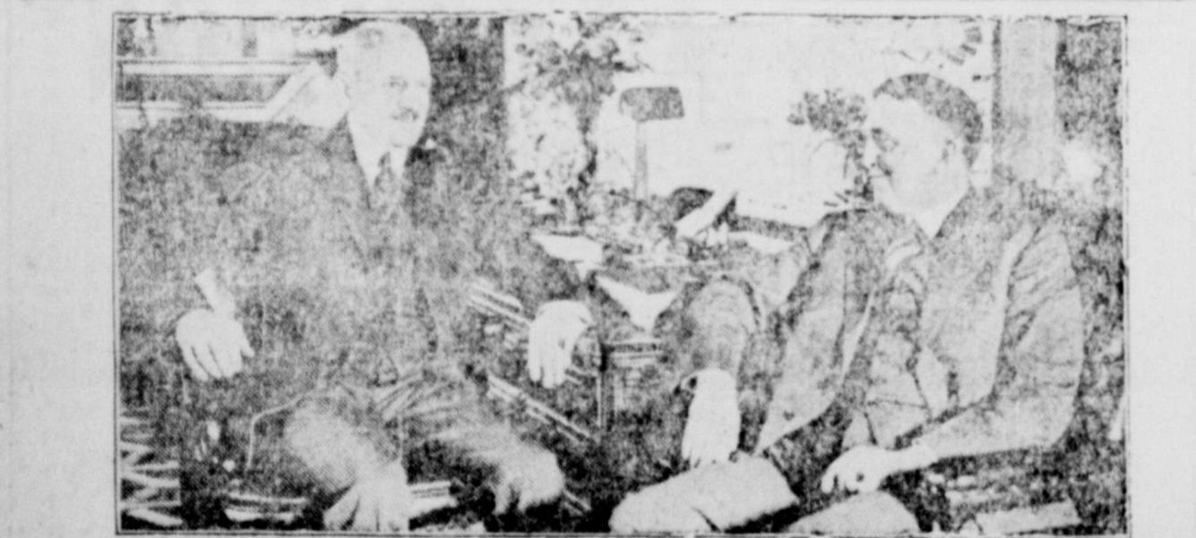
GENERAL PERSHING BACK "IN HARNESS" AFTER TOUR OF EUROPE General John J. Pershing slipped quietly back into Washington recently in the manner he had departed some months ago when he left for a trip to Europe. Photo shows General Pershing at his desk at the War Department with General John L. Hines, who was first to greet him on his arrival in Washington.