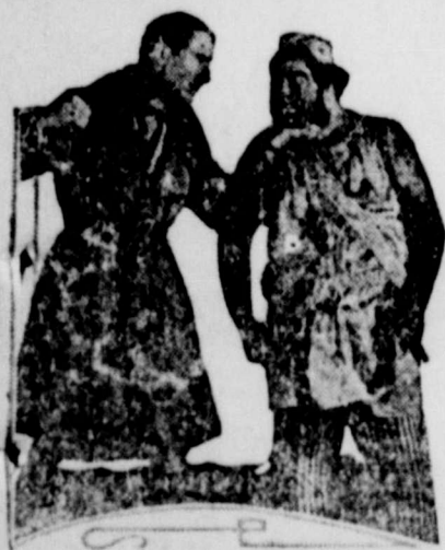
Rex Ingram, having just returned from Africa, where he made "The Arab" for Metro, shows an actor the Arabic starting point of a jaw-breaker.