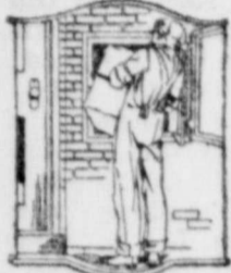
Outside Ice Convenience and 26 other Herrick features described in the book.

The beating rays of the noonday sun mean nothing to the prize-winning Herrick.