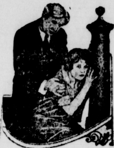
Scene from "LOVERS' LANE" A WARNER BROS. CLASSIC OF THE SCREEN

"LOVERS' LANE" BEGINS TWO-DAY ENGAGEMENT AT QUEEN THEATRE