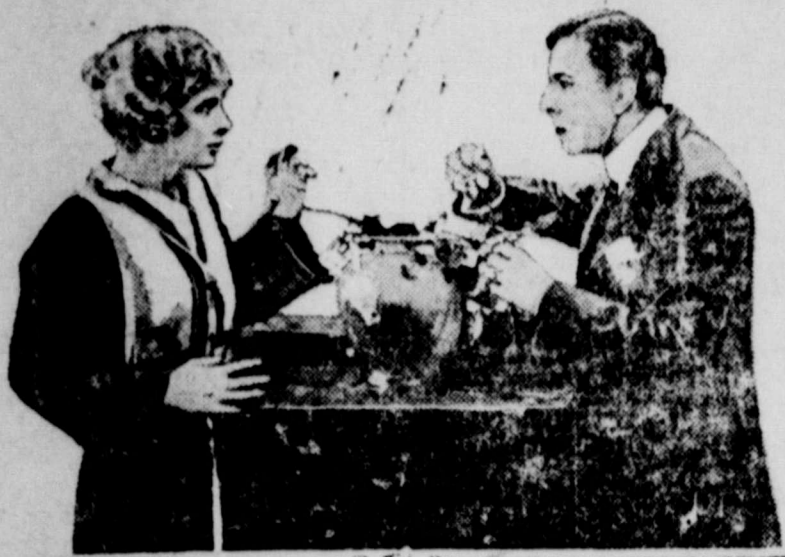
GEORGE ARLISS in "THE MAN WHO PLAYED GOD"