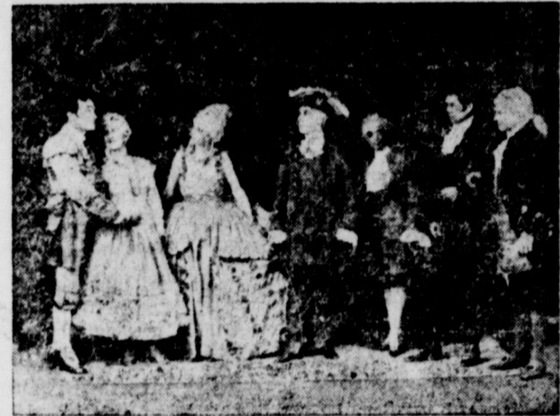
SCENE FROM MARRIAGE OF FIGARO