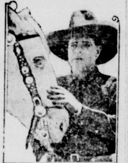
Scene from "THE WESTERN WALLOW" A UNIVERSAL PICTURE WITH JACK HOXIE