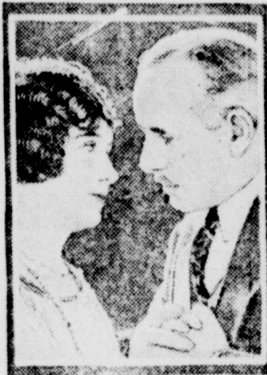
Lewis Stone and Florence Vidor in "Husbands and Lovers" QUEEN—Now Showing

The coroner's verdict: "It's a jack rabbit."