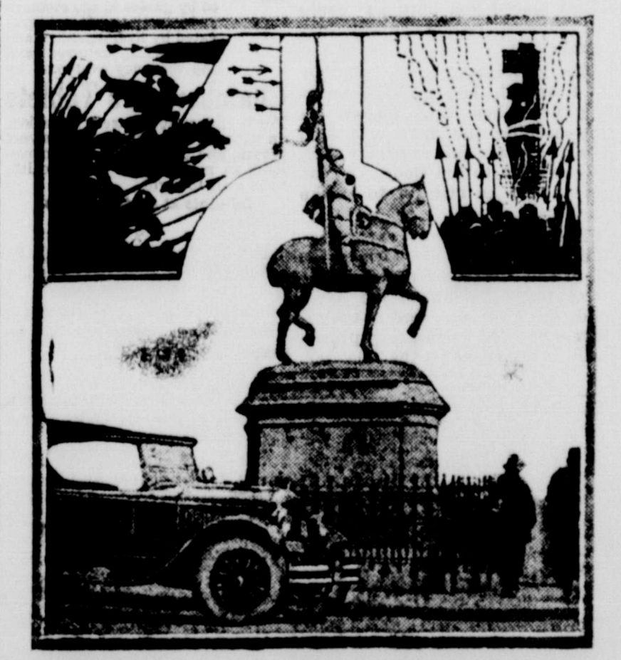
A World Famous Statue EVERYONE who goes to Paris makes it a point to see the famous statue of St. Joan of Arc, by Fremiet (1899) in the small Place de Rivoli. This gilded equestrian statue stands before the Hotel Regina, which was used by the American Red Cross during the war as headquarters, and is known to hundreds of Americans.