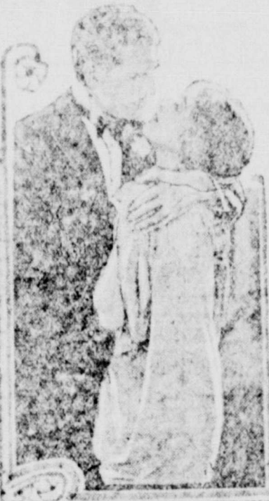
Irene Rich and John Roche in "A LOST LADY" A Warner "Classic of the Screen"

Beginning at the high pitch of emotional awakening in Marian