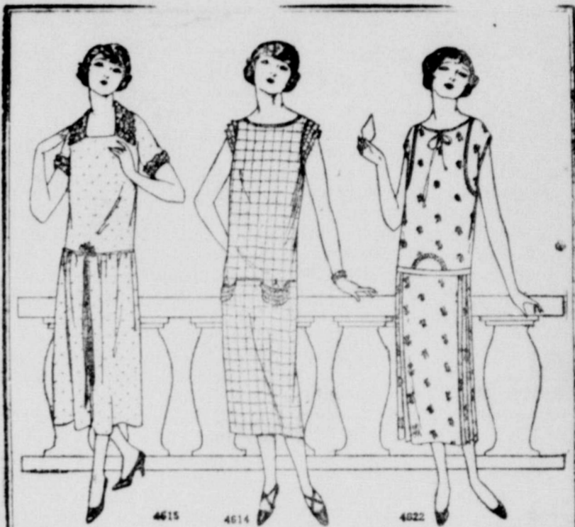
These Are Cheery, Summery-Looking Frocks

NOT too fussy and not too plain. Each one is trimmed with lace. All are fashioned of voile—cross-bar, figured and dotted.