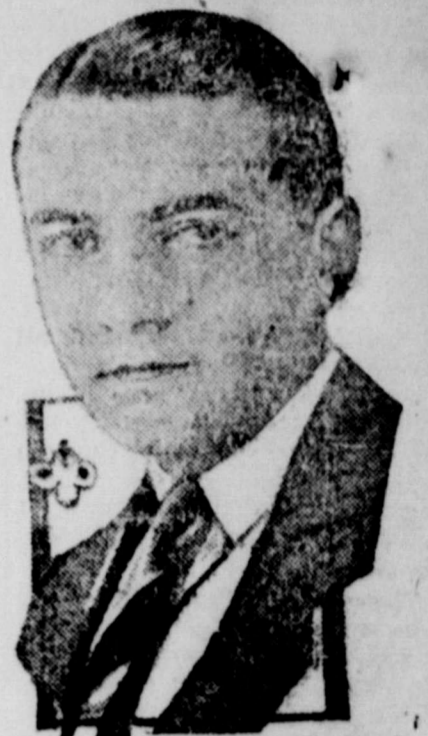
Richard Barthelmess in "New Toys"