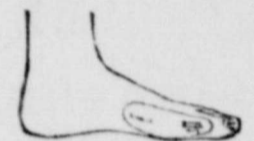
Dr. Scholl's Bunion Reducer instantly relieves bunions, prevents friction and pressure, preserves shape of the shoe, and gradually reduces growth by absorption. 75c each.