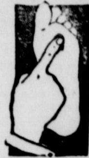
Pains, cramps or callouses at ball of foot indicate that arch has broken down. Dr. Scholl's Foot Comfort Appliances quickly relieve and correct this condition.