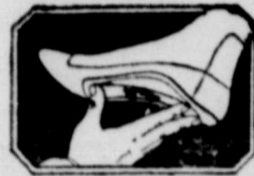
Dr. Scholl's Foot-Eazer relieves tired, aching, feet, weak and broken-down arches, weak ankles, painful heels and other foot troubles. Worn in any shoe. Light comfortable and springy. $3.50 per pair.