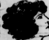
PATSY RUTH MILLER