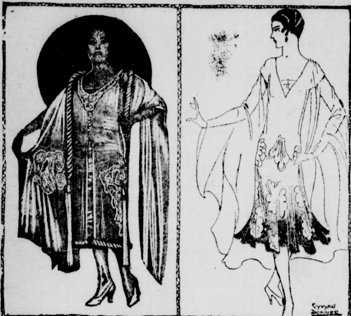
GLORIA SWANSON WEARS THIS EVENING ENSEMBLE IN SILVER & APRICOT, AFTER HER OWN DESIGN.