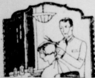
ARTISTIC AND SIMPLE BOBBING

AN ORDINANCE Regulating the admission of Shows known as Street Carnivals into the city of Ballinger and regulating the giving of medicine and other shows, and fixing penalties for violation thereof.