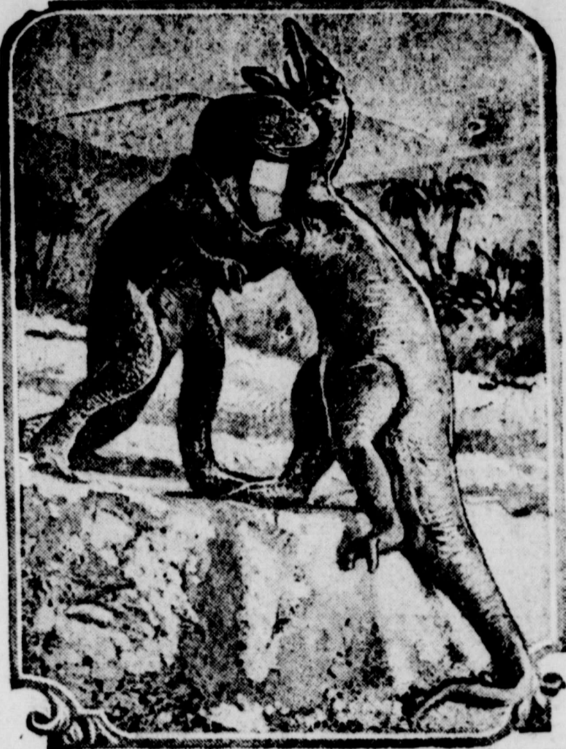
Prehistoric Monsters Battling. A Scene From 'The Lost World'