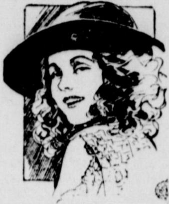
BETTY BRONSON IN THE PARAMOUNT PICTURE "THE GOLDEN PRINCESS"