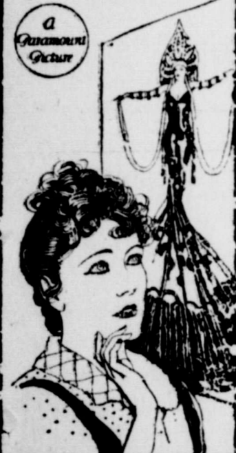
AN ALLAN DWAN PRODUCTION

All the drama and fire of "The Humming Bird"—the gowns and luxury of "A Society Scandal"—the gaiety and fun of "Manhandled."