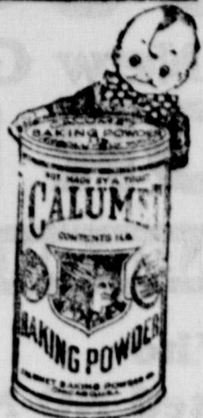
MADE BY TEST

SALES 2 1/2 TIMES THOSE OF ANY OTHER BRAND