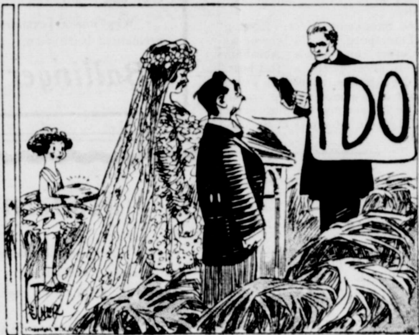
Famous Last Words