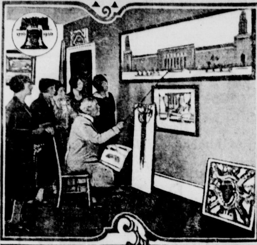
William de Leftwich Dodge, famous mural artist, in his studio at the Sesqui-Centennial International Exposition grounds in Philadelphia, where the 150th anniversary of signing the Declaration of Independence will be celebrated from June, to December, of this year, giving instructions to a group of young artists who are creating the "Rainbow City." Mr. Dodge is the color expert for the exposition, and every bit of color work done must be approved by him.