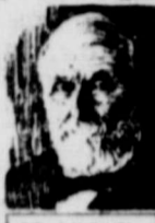
Dr. Caldwell's SYRUP PEPSIN

For a free trial bottle send name and address to Pepsin Syrup Company, Monticello, Illinois.