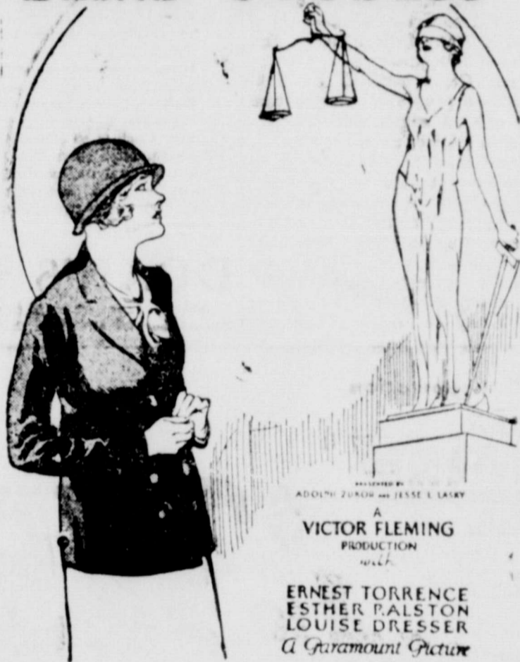
VICTOR FLEMING PRODUCTION