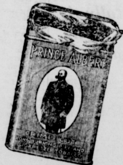
P. A. is sold everywhere. And always with every bit of bite and punch reserved by the Prince Albert process.

If you sometimes smoke a pipe (or would like to), try Prince Albert this way too. Pipe-smokers who thought they were all set on a smoke-program have tried Prince Albert and found it a revelation. Buy some P. A. today. Try this wonderful tobacco both ways.