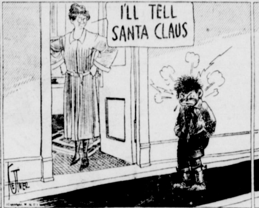
Famous Last Words

(By Associated Press) SAN ANTONIO, Dec. 7.—The management of the Gunter Hotel here today estimated that the fire last night had not done more than $1,200 damage. The blaze started in the wooden scaffolding of the temporary elevator shaft.