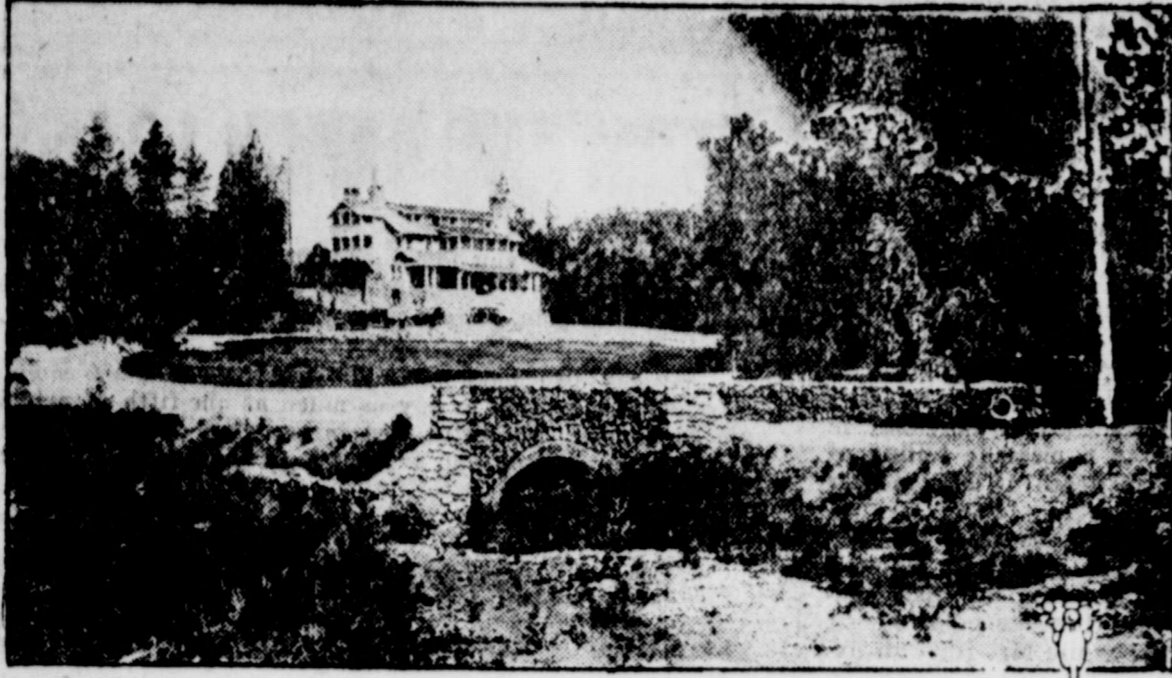
In the South Dakota state park in the Black Hills, where President Coolidge and his family will spend the summer, it will not be difficult for the executive to have complete privacy. The game lodge, which will be the presidential home, is visible from park highways only when the winding road comes immediately upon it. This close-up glimpse of the lodge is the first the tourist gets upon entering the park.