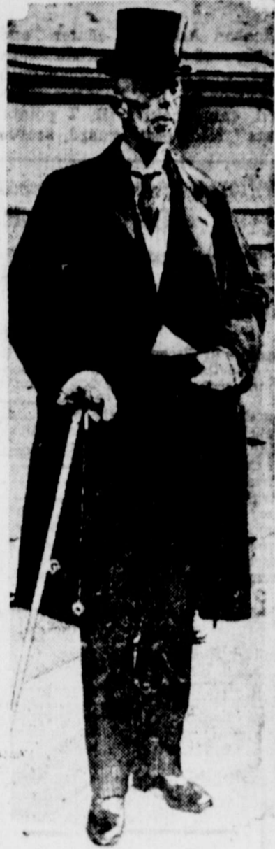
Here's an unusually good photograph of King Gustave, taken at Stockholm, Sweden—a close-range snapshot of more than ordinary interest as a study in character. It also depicts what the well-dressed Swedish gentleman will wear, although His Majesty's hat looks as if it was a little bit too small.