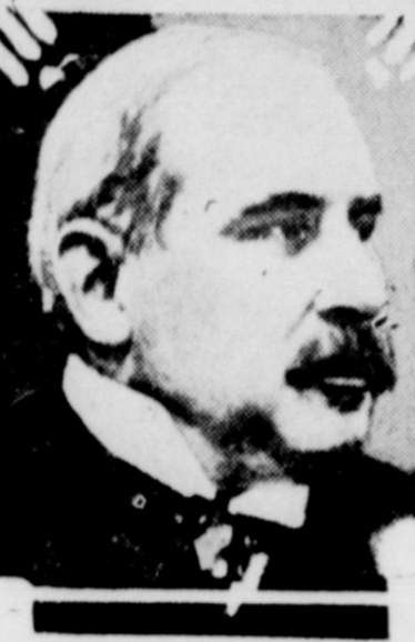
J. Pierpont Morgan (above), has been elected chairman of the U. S. Steel Corporation, succeeding the late Judge Elbert H. Gary. The election was officially announced after a meeting of the directors in New York city.