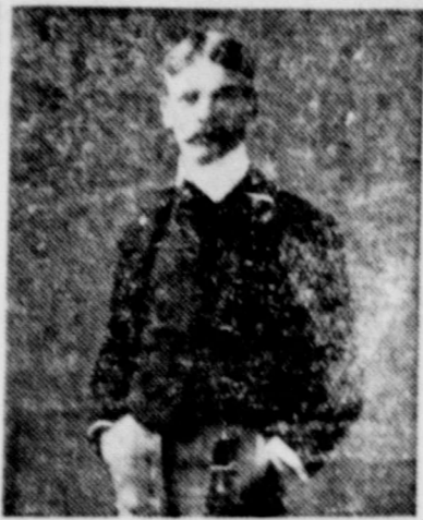
Photographic Styles of Twenty Years Ago