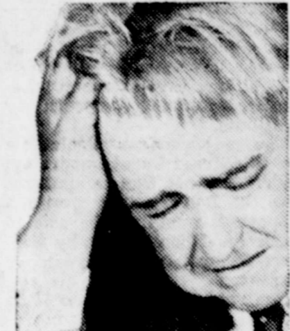
THERE is nothing quite like Bayer Aspirin for all sorts of aches and pains, but be sure it is genuine Bayer...

"In use over 87 years. NC-191" Theford: BLACK-DRAUGHT Indigestion Biliousness