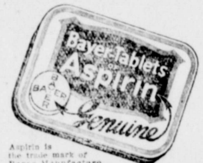
Aspirin is the trade mark of Bayer, Manufacturer of Monacetic Acidester of Salicylic Acid

NURSES know, and doctors have declared there's nothing quite like Bayer Aspirin for all sorts of aches and pains, but be sure it is genuine Bayer; that name must be on the package, and on every tablet. Bayer is genuine, and the word genuine—in red—is on every box. You can't go wrong if you will just look at the box: