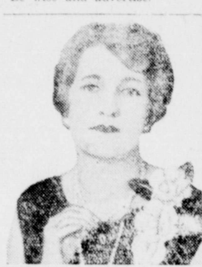
Bridge Party Held In Spite of Cold!