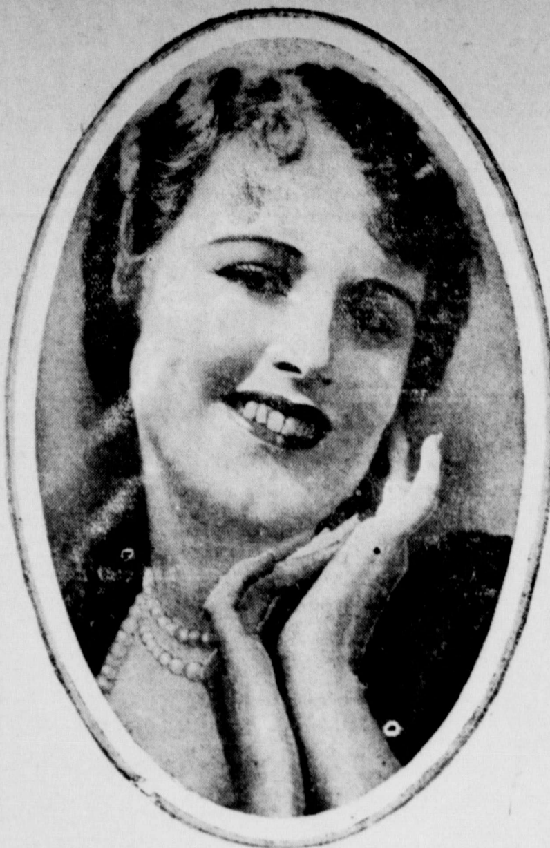
June Collyer feminine lead in "ME, GANGSTER" FOX PICTURE