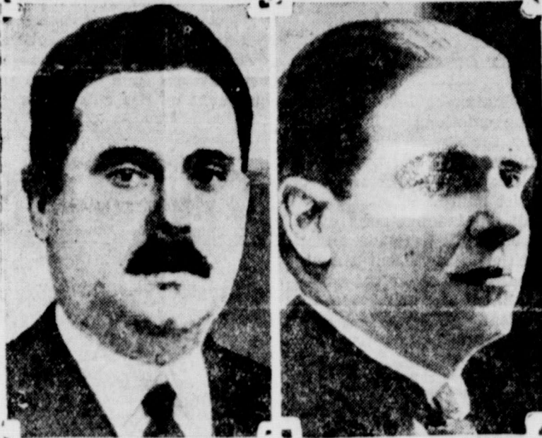
President Hernando Siles (left), of Bolivia, and Dr. Jose P. Gugguari, head of the government of Paraguay, who are trying to hold their subjects in leash pending diplomatic moves. Meanwhile Pan-American League is endeavoring to smooth over territorial differences between the two countries.