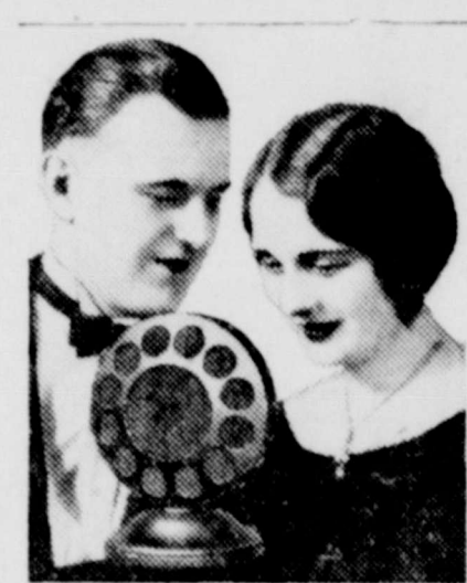
Cold Can't Cause Them to Disappoint!

ant-tasting tablets, one of which will A bad cold that has settled on the better than "doping," so remember the