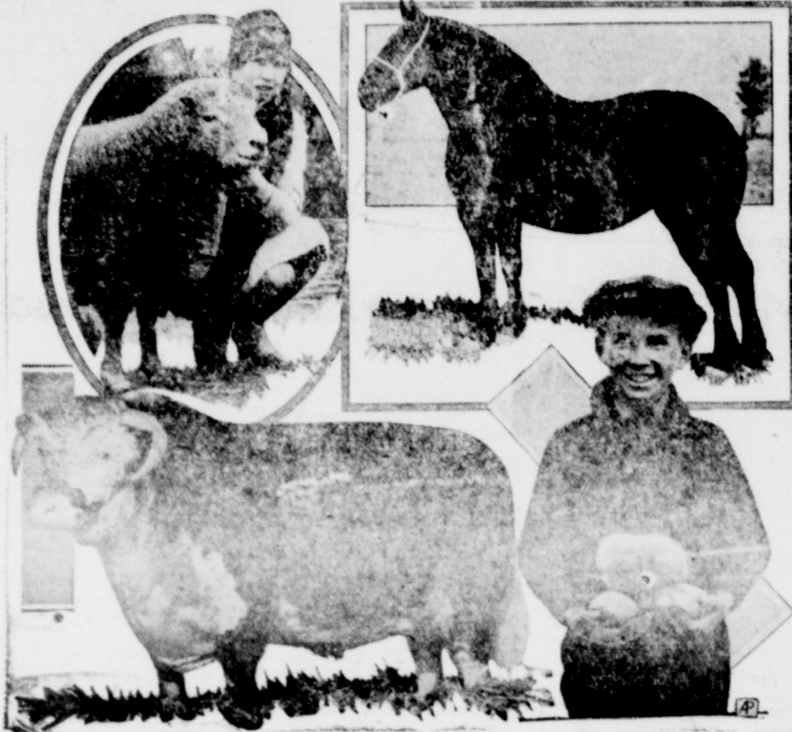
Percheron mare (upper right) and Hereford bull (lower left), types that make the International Livestock exposition the world's premier. Hundreds of farm boys and girls will compete with their elders from potatoes (lower right) to grand champion beef steer.

CHICAGO, Dec. 4.—The tanbark calls to pounding hoofs, and thousands are thronging agriculture's greatest show—the International Livestock Exposition, which opened November 30, and closes next Saturday, December 7. To it have come champions from all other livestock shows, primed for competition in the rich awards.