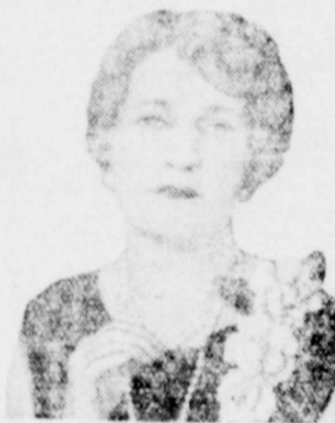
Bridge Party Held In Spite of Cold!

Don't despair some day your social calendar is full, and you awake with a miserable cold. Be rid of it by noon! You can, if you know the secret, a simple compound that settles colds in record time. Every druggist has this wonderful tablet. Pape's Cold Compound is what they call it. Harmless, but it's a better way to drive away colds than by dosing with drugs that make the head ring. Don't go to a party red-nosed and with watery eyes, get this quick relief for 35c at any druggist.