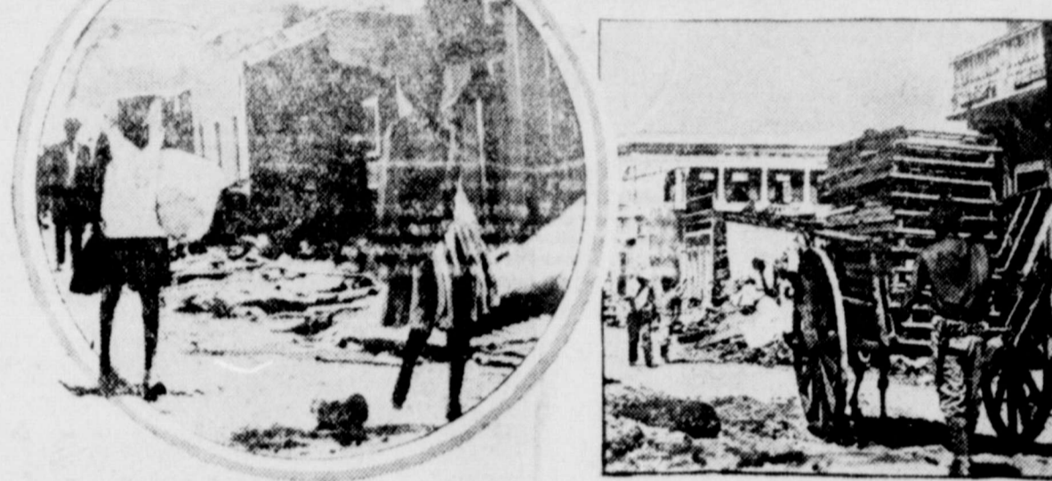
Relief from every possible source was rushed to the aid of hurricane sufferers in Santo Domingo. The above exclusive Associated Press photographs flown from the stricken city show results of the disaster. An air view of the ruins is shown above. On the left is a picture of refugees taking a few possessions from their ruined homes, and the picture on the right shows a soldier aiding in clearing streets of debris.