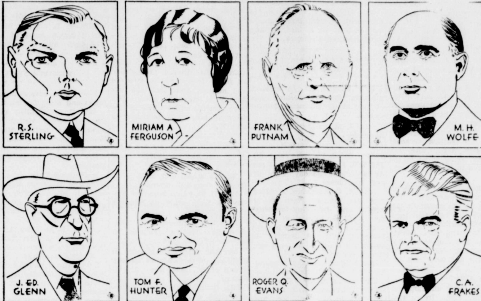
Here are the eight candidates for governor. You're going to vote for one of them Saturday, if you're a good citizen. One of the eight will be handed the reins of the government of the State of Texas by vote of the people, and your vote will be worth as much as any other. The sketches were made exclusively for this paper by Texas News Photos.