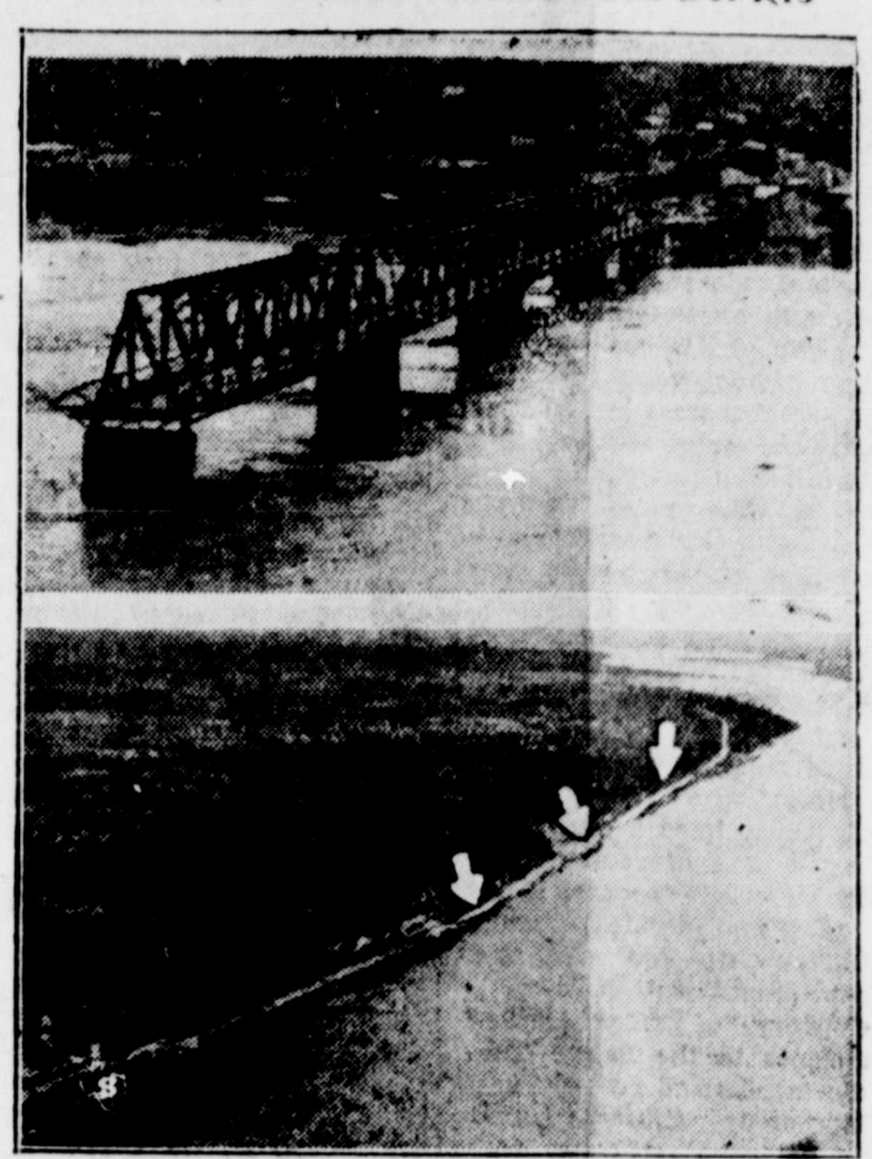
The top photo is a closeup aerial photo of the bridge over the Rio Grande river showing how the middle spans were washed away by debris piling up against them as the muddy waters swept towards the sea. Below is a section of the Southern Pacific tracks near Del Rio, inundated by the Rio Grand