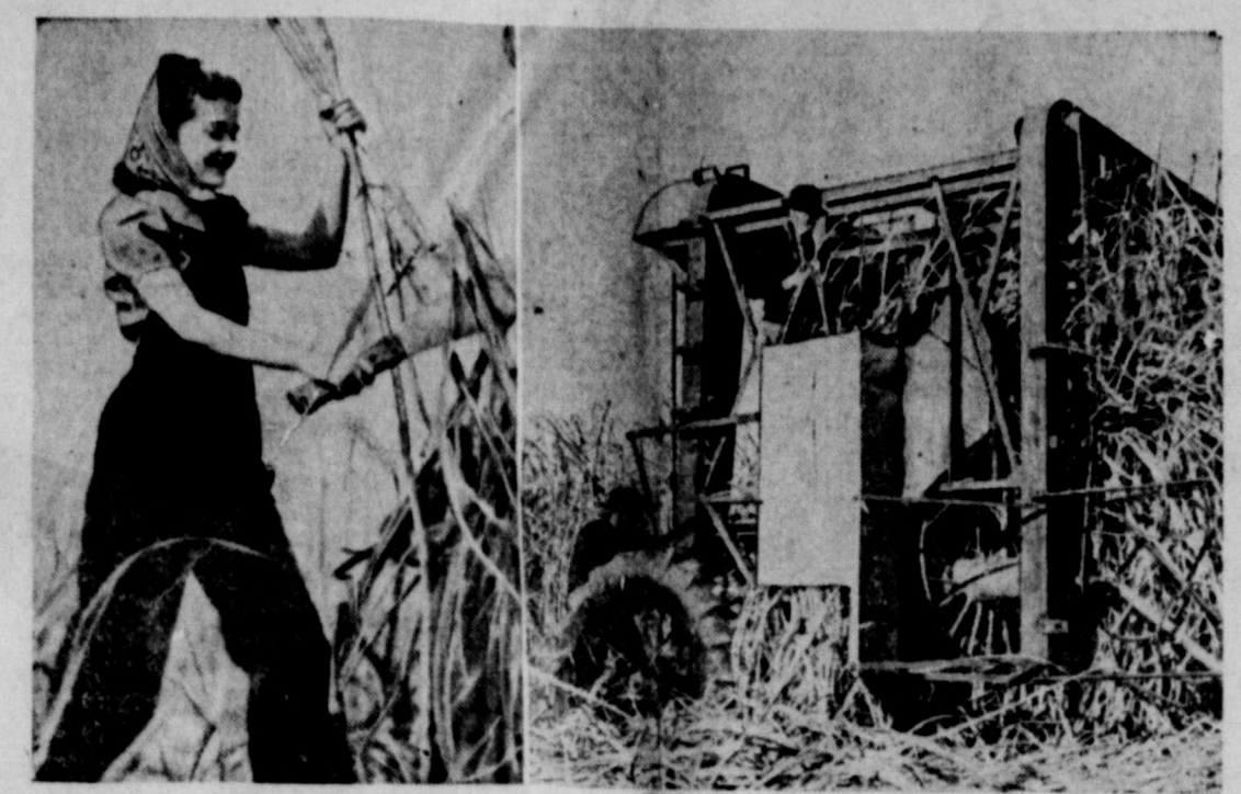
father get his sugar cane to the warehouse. In sharp contrast to the old manner of harvesting cane is the new Thomson machine. Screws straighten the cane so that rotating knives can lop off the tops. It then cuts the cane with a three-inch spaced blade saw at its bottom. The