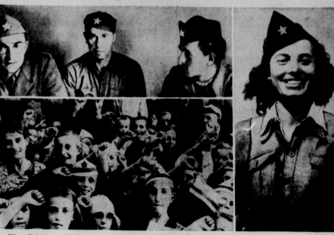
When British naval officers recently visited a Jugoslavian village held by patriot partisan forces they were taken to meet the commander (top left). At his right is his interpreter. Bottom left: Using the partisan army's elenched fist communist salute, Jugoslavian children greet the British officers. They wear the starmarked caps of their organization. Right: She doesn't look it, but this young woman has the reputation of being an outstanding sniper and anti-Nazi saboteur. Women like her comprise 25 per cent of the partisan army. No names are given to shield friends and relatives from possible Nazi reprisals.