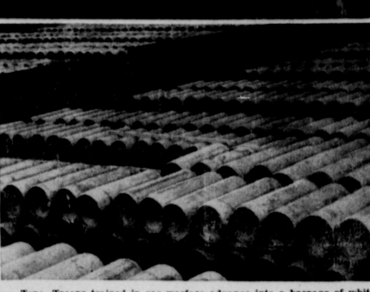
Top: Troops trained in gas warfare advance into a barrage of white osphorus produced at an eastern arsenal. Bottom: Hundreds of thousands of gas-filled cylinders lie at this arsenal ready to be packed into shells and bombs if the enemy should initiate gas warfare. President Roosevelt has warned the Nazis that we are prepared to retaliate in kind.