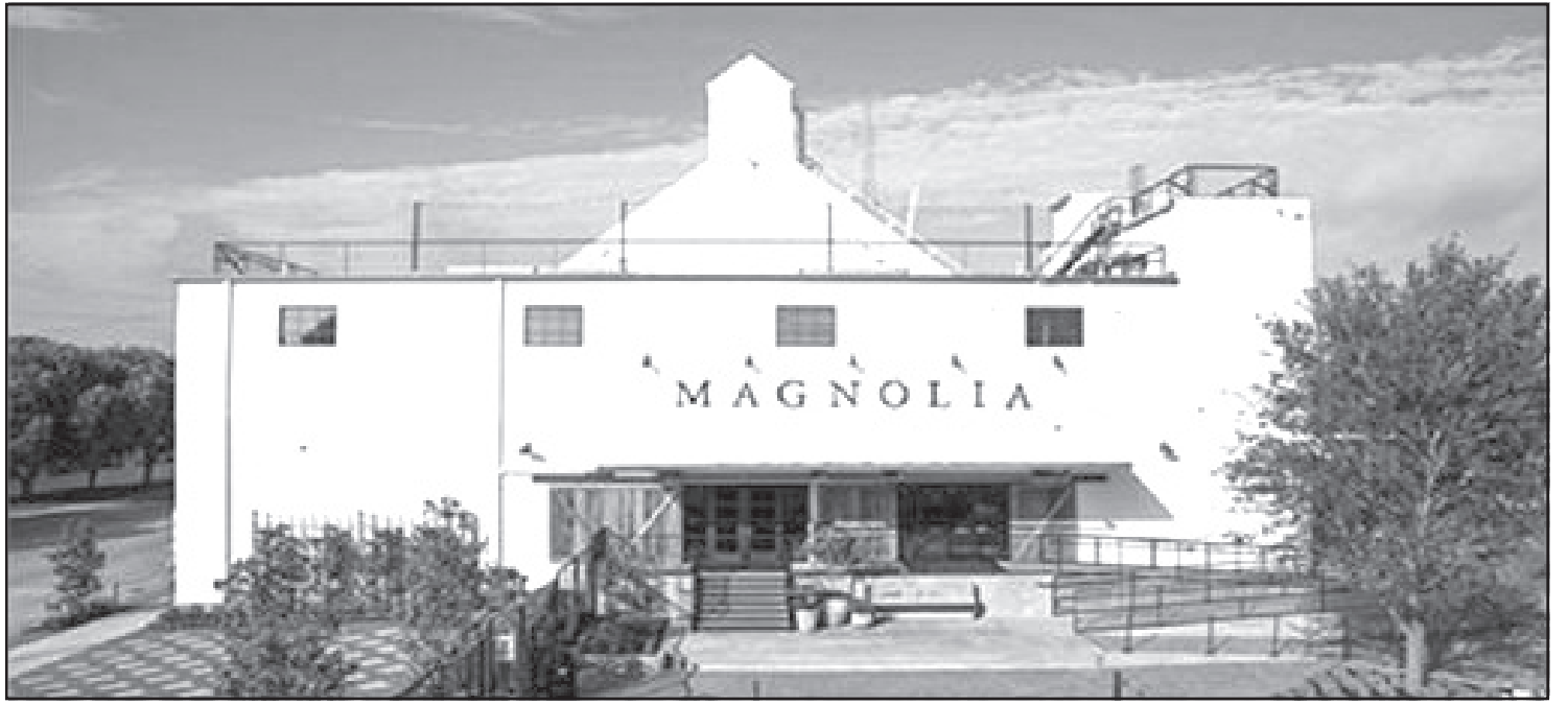
A MAGNOLIA ROAD TRIP —A behind-the-scenes tour of Chip and Joanna Gains' Magnolia Market at the Silos in Waco is one of the premiere offerings at the fund raising auction for King's Manor Founders Day on July 15. The outing is a trip for four and includes two nights at a bed and breakfast.

From 1976 to 1992, the Gatlin Brothers toured the U.S., Canada and overseas,