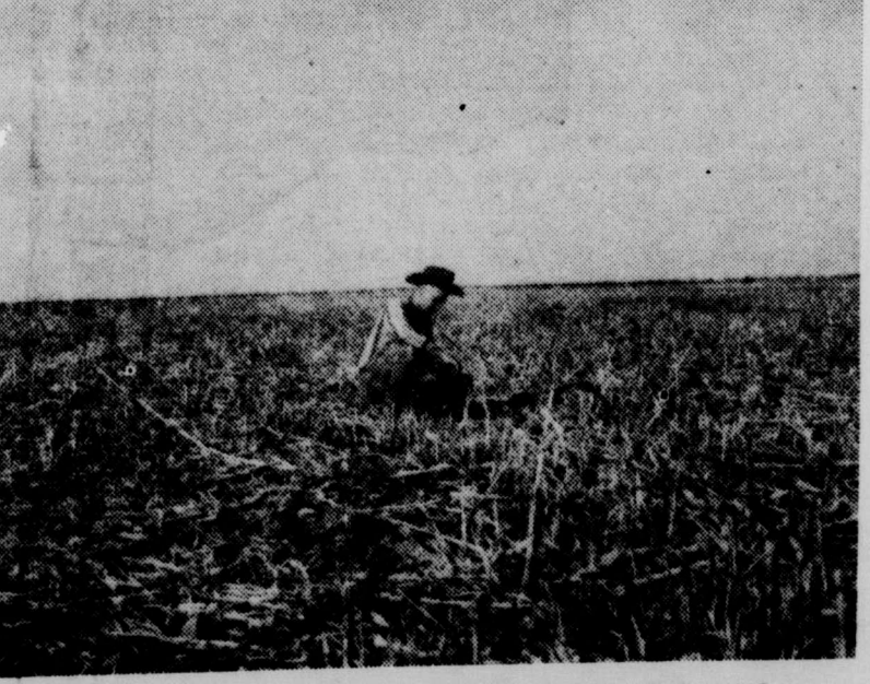
WATERWAY DUE FOR PLANTING-Robert Gober, above, Crowell Soil Conservation Service technician, examines sorghum cover on one of the waterways on the Jack Welch farm. This waterway is scheduled to be planted to grass in the spring of 1967.