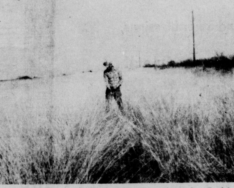
COMPLETED WATERWAY-This photo shows Joe Coufal, Soil Conservation Service employee, examining an excellent stand of K. R. Bluestem in Recie Womack's waterway. This waterway was mulched with cotton burrs and seeded to grass