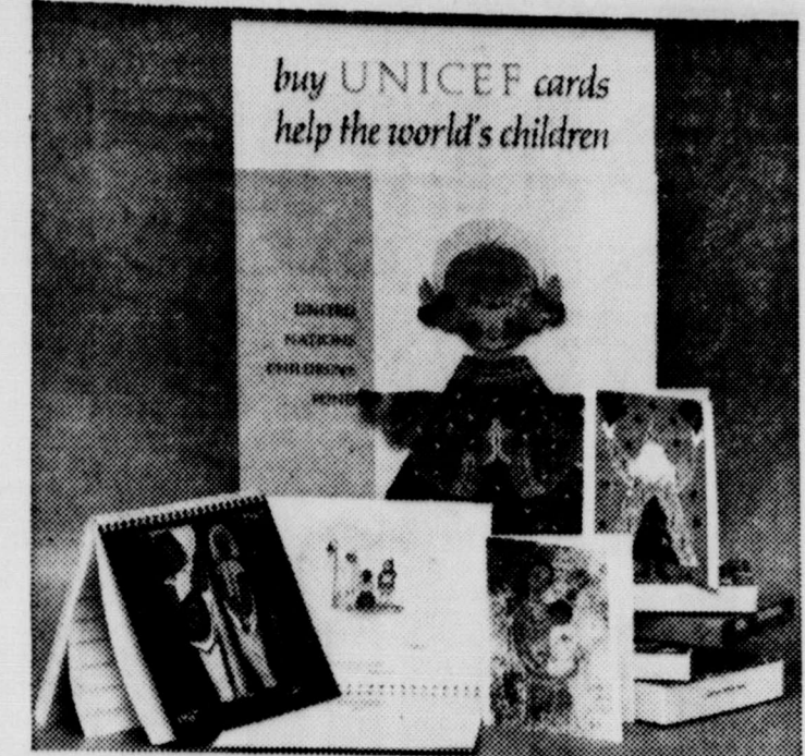
YULETIDE GIFTS which will save young lives are offered by Nobel-prizewinning United Nations Children's Fund. UNICEF Greeting Cards, right, include 13 designs by world-famous artists, cost $1.25 a box of ten. Engagement Calendar, left, features 52 lovely paintings ($2.50 ppd). Free full color brochure from UNICEF, P.O. Box 22, Church St. Station, New York 10008.