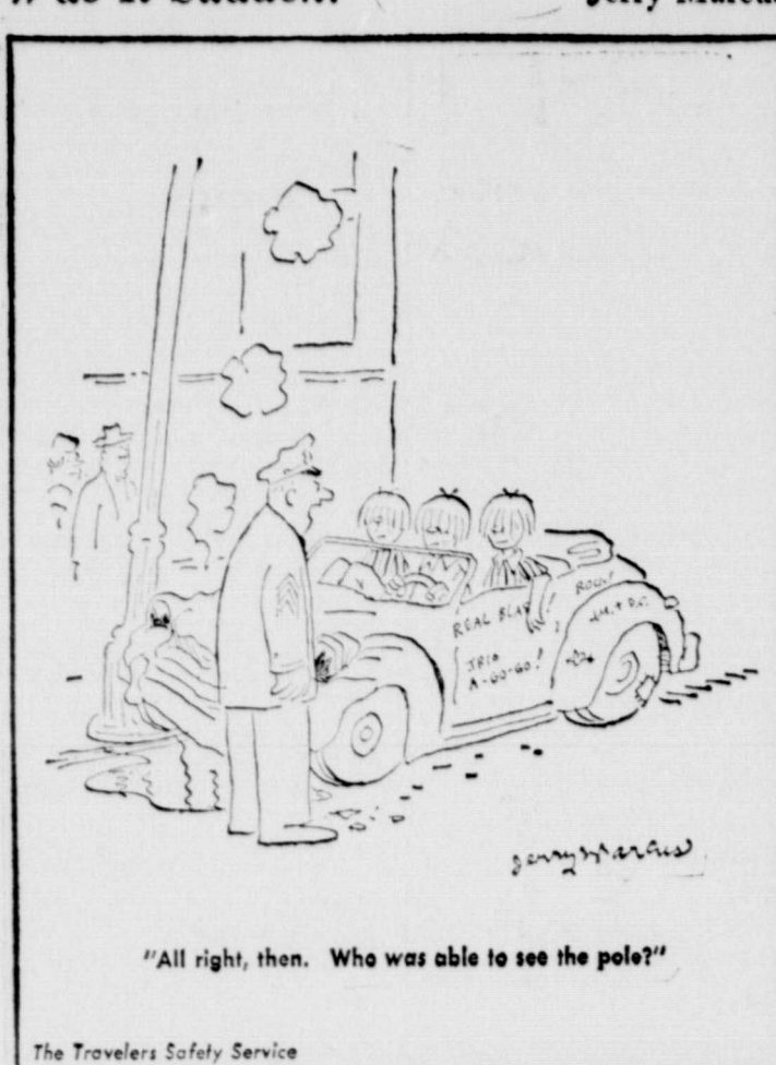
One out of three fatal accidents involves a driver under 25 years of age.