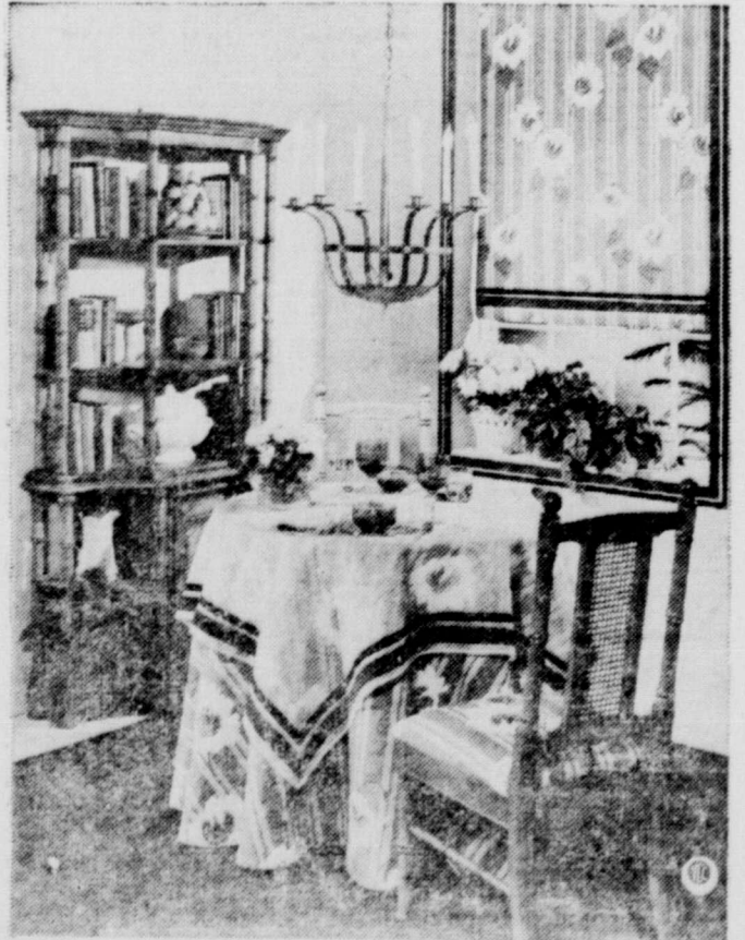
BE YOUR OWN DECORATOR-Add color and individuality to your dining area by making your own laminated window shades and table covering with brilliant floral-printed cottons. Laminated shades can be made by ironing cotton fabrics to a new heat-sensitive, adhesive-coated shade cloth called Tontine. Available in widths to 68 inches, it comes in opaque or trans-

The first farm to market roa its 50th anniversary year, 1967, —was built in 1936. It extended the Texas Highway Department 5.8 miles from Mount Enterprise to Shiloh in Rusk County.